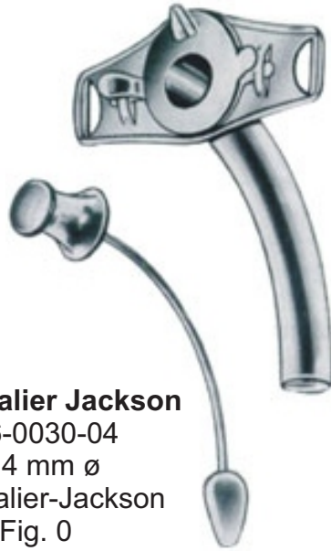
Chavalier Jackson MI-16-0030-04 Size: 4 mm ø Chevalier-Jackson Tube Fig. 0