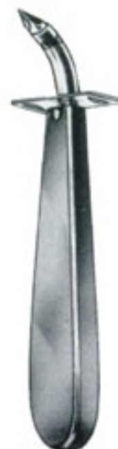
Uckerman MI-16-0024-08 Size: "13 cm / 5" MI-16-0024-10 Size: 13 cm/5"