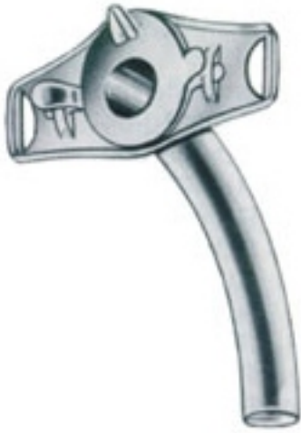
Luer MI-16-0028-04 Size: 4 mm ø Luer Tube Fig. 0