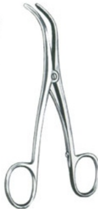
Trousseau- Baby MI-16-0008-13 Size: "13 cm / 5"" Trousseau-Baby Dilators