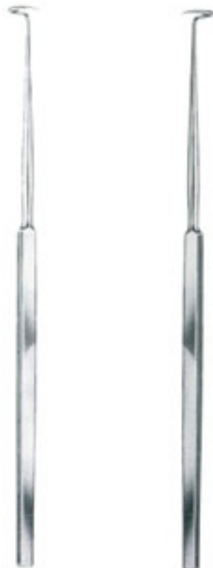
Bose MI-16-0015-16 Size: "16 cm / 6¼" Sharp Left